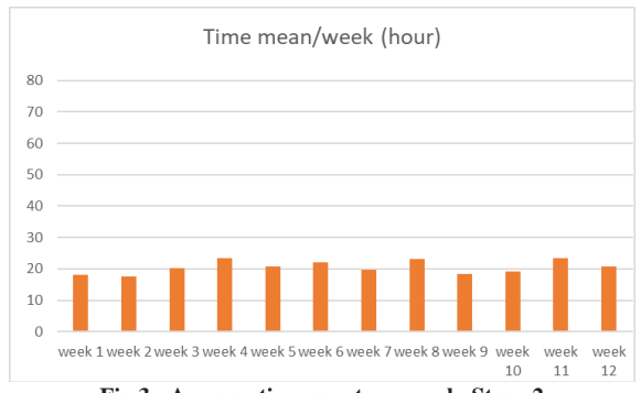
Fig.3 - Average time spent per week, Stage 2

According to the interviewees, at this stage the delay in updating the data referring to the components that enter the company, made the sequential processes of inventory, purchasing and production planning had bottlenecks, with that, there were daily difficulties in scheduling and production planning due to the lack of information about the inputs, that is, the delay in the input of invoices generated doubt about the receipt of the materials, causing delays in the processes.