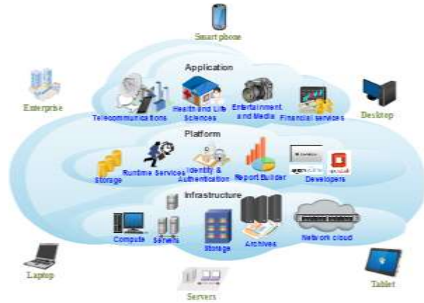
Fig.1: Cloud Computing

Cloud Computing is new technology generation that includes a collection branches of computer studies (security, programming, storage, Network...), and other sciences (physic, math...). It isn't just about accessing applications over the web. It can be almost anything, such as, it used for collection of data in the context of security or data management. So we consider the cloud computing as the primary source for all of the IT services, such as our first source of file storage (Images, files, documents), to deploy services, to share and to backup data as show in the figure 1.