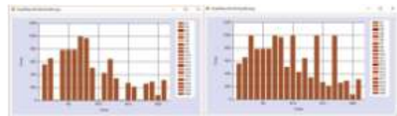
Fig 2 Residual energy of node comparison graph before and after charging

To increase their residual energy charging of node is done. Then another graph is charged nodes with capacitors who stores energy from wind power and solar power.