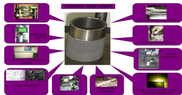
Figure 2: Inspection & Testing Techniques.

Inspection of liner carried out to check its acceptability those are Hardness testing - Hardness of w/p can be checked on hardness testing machine HRB/HRC/BHN.