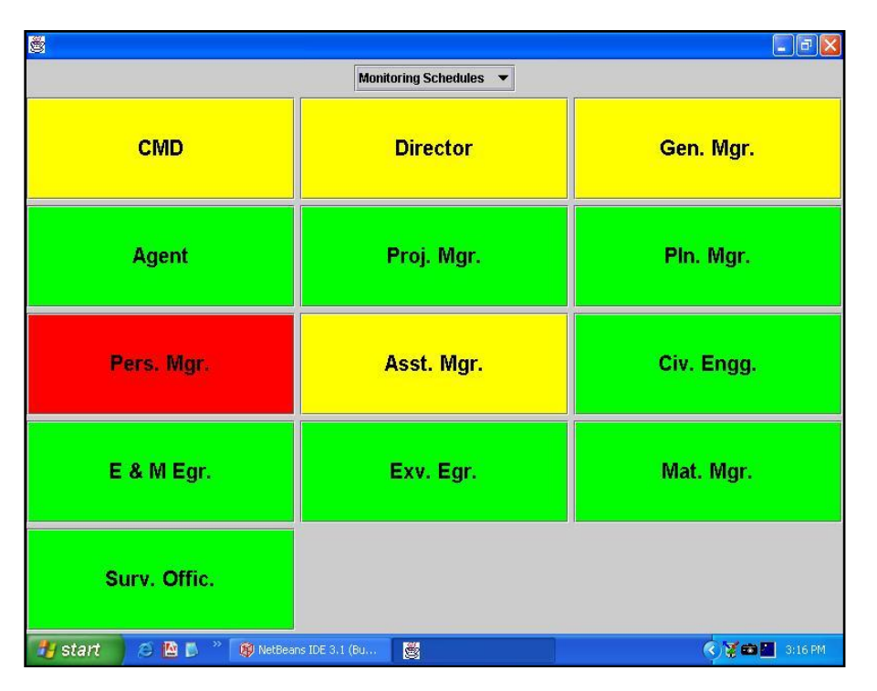
TABLE N0- 3: MODEL PROGRAM RUN OF MBO

Table No-3 shows Model Run of MBO for a Particular Project for the Review Month as MBO.dat.