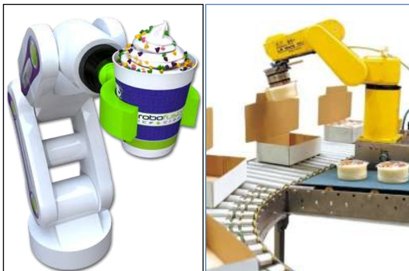
Fig. 2: Picking and Packing robot