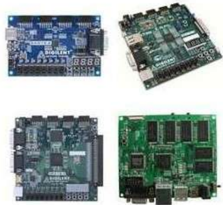
Fig.1 FPGA BOARD

The FPGA board is a computing technology that has been in use nearly thirty years by engineering students and professionals alike. In design of an electronics project that requires computation and programming, the FPGA board is the best choice. The ease and flexibility afforded by the boards have made them incredibly popular. Fig.1 shows an FPGA board.