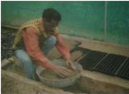
Fig. Manual seed feeding process.

The half of box is filled by coco peat powder thoroughly in all the holes, after completion of near about 9 to 10 then all these boxes are put one over another and pressed so that all holes are filled to half of size after that seed are put one by one in these holes by the labours. After putting seeds in the holes of the box again coco peat powder is put in the box and excess amount of powder which will remain in the box is removed.