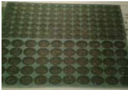
Fig. Completion of seed feeding process.

The time required for this process is 3 to 4 minutes for 9 to 10 boxes. Then after completing all the process the tray is kept in proper environment and water is being fed when required. The sufficient height of plants in the tray will grow then it is supplied to customers.