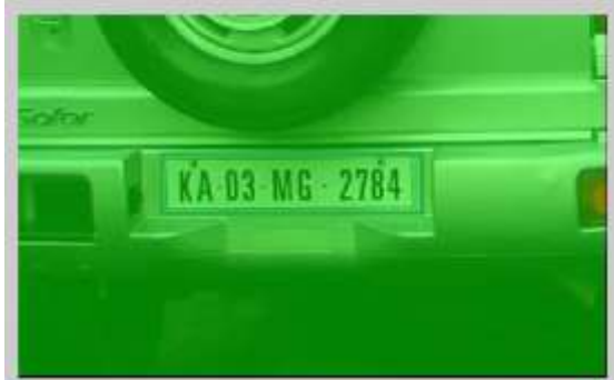
Fig. 2 Detected plate highlighted by green colour

The proposed methodology for the given system is implemented using MATLAB r 2013b. The system is built using the above algorithm and the system is validated for a set of images of the car license plate. Following results have been obtained.