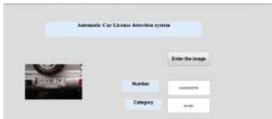
Fig. 3 Final output of the system.

It can be seen that the system was capable of detecting the license plate and correctly recognize the license plate number along with the category of the license plate as a private vehicle.