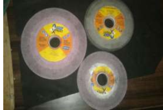
Fig. 3 Grinding Wheels used as cutting tool