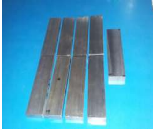
Fig. 2 work piece used for experiment.

The work piece material selected for experiment was High Carbon High Chromium (AISI D3). The chemical and physical properties are given in table 1. and Table 2. respectively