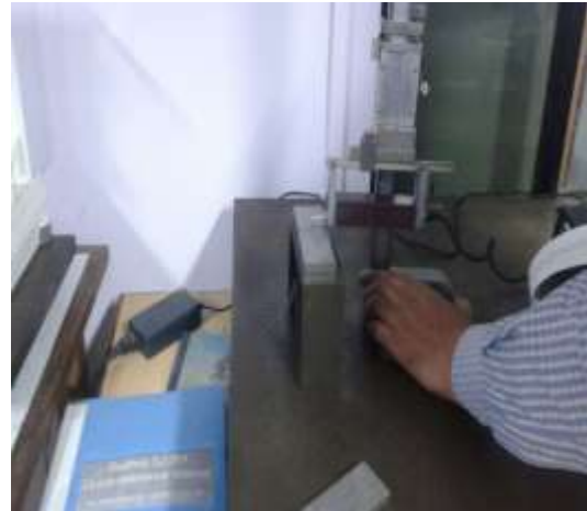
Fig. 4 surface roughness test

The surface roughness test was done by using Mitutoyo surface roughness tester ‘Surftest SJ 301’ was used. The probe was adjusted to measure the Ra value. The probe was moved a distance of 3mm.