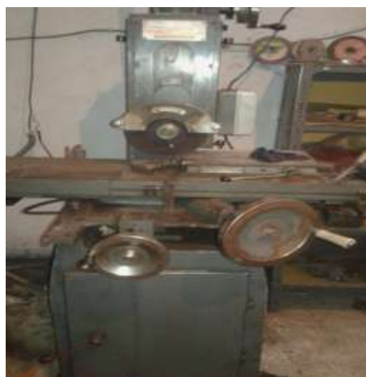
Fig. 1 Grinding Machine