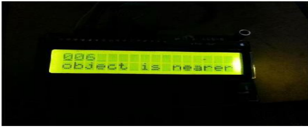
Figure 3. Ultrasonic Detector Output