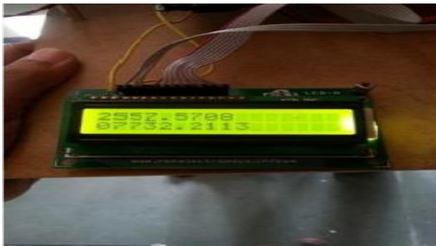
Figure 4. Latitude And Longitude Of Telecommunication Department, R.V.C.E.

The LCD shows the reading of latitude and longitude of the place where the person is standing or walking as shown in figure 4.