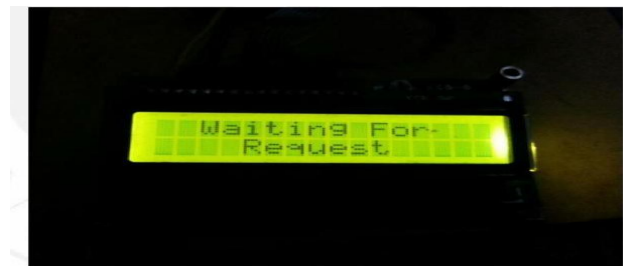
Figure 2. LCD Initialisation

When the hardware kit is supplied power through battery then LCD shows the output “waiting for request” during its initial stages which signifies that the device is initialized as shown in figure 2.