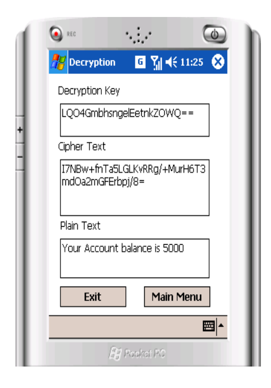
Fig. 4. Secure Reply from Server

To be a secure system, it must satisfy Confidentiality, Authentication, Integrity and Non-Repudiation Secure SMS system maintains confidentiality using AES cryptography and Non-Repudiation using session key. Here 3-factor authentication is used for authentication and security purpose whereas Message integrity is carried out using MD5 algorithm.