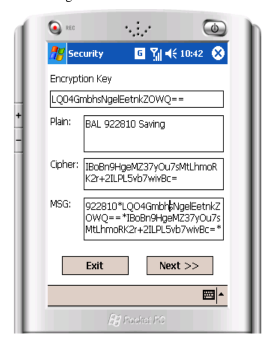
Fig. 3. Generating 4-Part Secure Message

We have carried out 6 types of transaction including Account Balance, Mini transactions, Cheque Book Request, Cheque Stop request, Pay Bill and Fund Transfer. Following are some sample client application module. The figure no. 3 shows session key, user query in fixed plain text format, cipher text generated from combination of plain text and his MPIN and 4-part secure SMS message generated as per format discussed. This last message is sent to server.