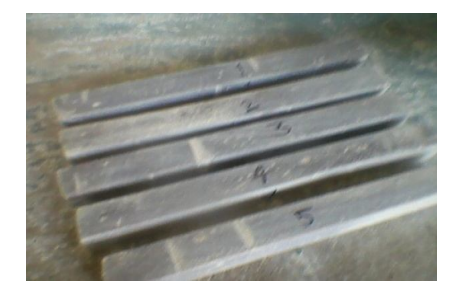
Fig 7 The Composite Materials for as Per ASTM Standards Differen tRatios of Powders