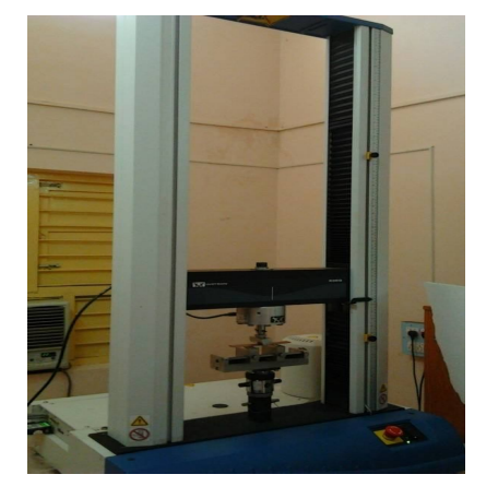
Fig 8 Testing of Composite Materials