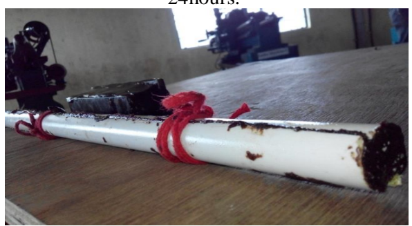
Fig 5 The Composite Materials inside the Related Dies

7. After drying, the composite material is removed from the dies; cut and finish the composite material into pieces as per ASTM Standards.