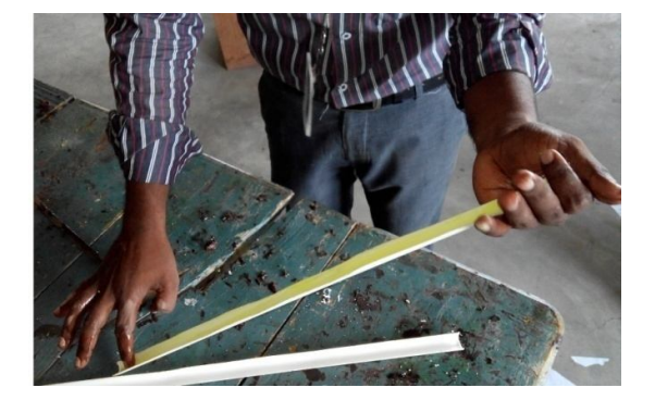
Fig 1 The Dies for Prepare Composite Materials

2. Next, different size of dies is prepared for variable composites for different tests. For the compression test very thick mild steel plates are welded at each ends of the plates to join the cube mould cavity of size 40mm. For tensile test, PVC pipes of internal diameter of 1.6 cm is considered and cut at middle through the length of pipe for composite material filling and removing. For impact test take 3 MS plates and weld through the length to provide rectangular mould cavity and further the composite is filled in the pipe.