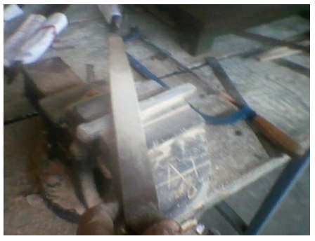
Fig 6 cutting and finishing of specimens

7. After drying, the composite material is removed from the dies; cut and finish the composite material into pieces as per ASTM Standards.