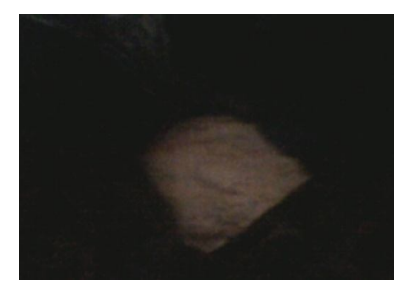
Fig 3 Preparation of Eggshell Powder

5. further the composite is prepared by taking, the coir fiber powder and eggshell powder at different ratios and add epoxy hardener to prepare good mixture at room temperature.