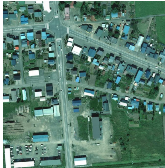
Fig.2.Color aerial imagery of Saroma-cho, Japan

A portion of a color aerial imagery of pixel to ground resolution of 10cm/pixel is shown in Fig.2. This imagery is provided by the Saroma-cho Local Government, Japan. This RGB imagery is of 1/2500 of scale ratio is analysed in the current research work.