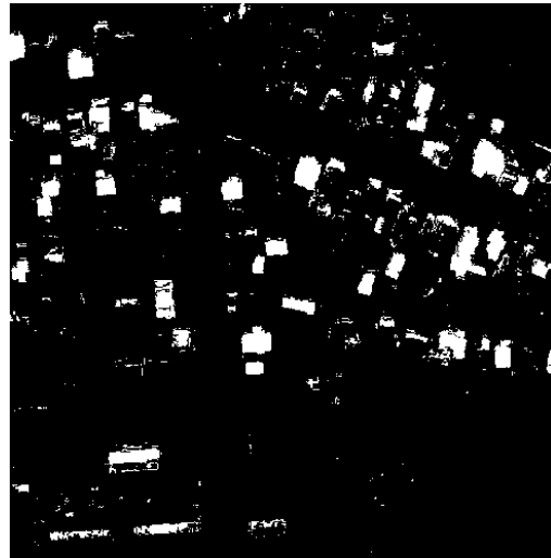
Fig.4. Blue Roof Segmented