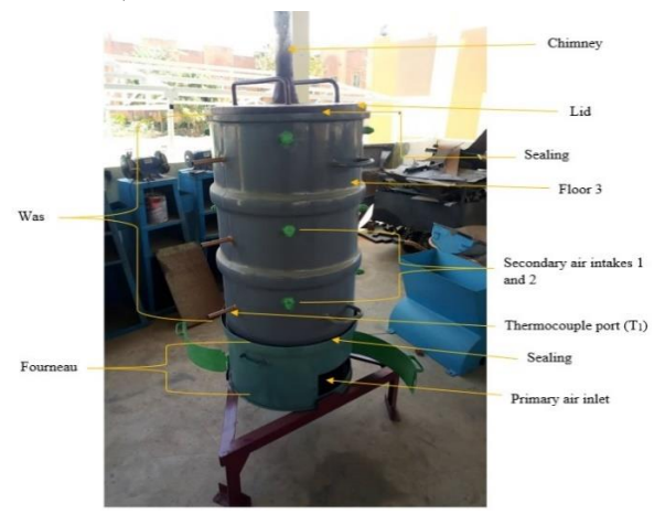
Figure 1: Study carbonizer

• The furnace is 32 cm high. It has two parallel air inlets with 10 cm * 40 cm arranged 4 cm from the bottom. A grid is placed 4 cm above the air inlets. A sealing groove connects the two parts of the carbonator (drum and furnace).