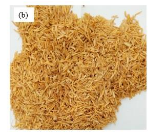
Figure 2: (a) Raw doum palm shells, (b) Raw rice husk.