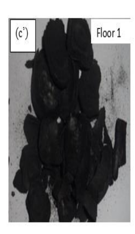
Figure 4: Charcoals obtained from the rice husk and doum palm hulls, (a, a ') floor 3; (b, b ') floor 2; (c, c ') floor 1.

The coal obtained in stage 1 can be used for domestic use and gasification, with a volatile matter content of 20 to 30% [2]. As for the coals of the other two stages, 2 and 3 can be used for gasification. By comparing the results of stage 3 having undergone less mass loss in Table 2 presenting some data on the different torrefactions, we note that the results of stage 3 for the mass yield, energy, volatile matter, fixed carbon, ash rate, and PCS are in the different intervals of severe torrefaction, which allows us to conclude that stage 3 has undergone a severe roasting. Referring to the work of Blin [11], who states that we can classify coal according to the rate of volatile matter and its fixed carbon content, we can compare the result of the coal of stage 1 to those obtained in the work of Zeïda for the carbonization of cashew nut cake [12]. It obtained a volatile matter content of 40.75% and 51.64% fixed carbon, respectively, against 29.38% and 52.32% for stage 1 of our carbonizer. Analysis of these results shows that the charcoal obtained in stage 1 is better than that obtained by ZEÏDA for cashew cake.