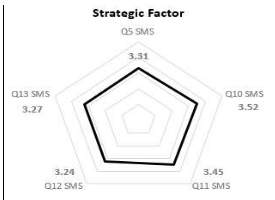
Fig. 1 Means of strategic factor