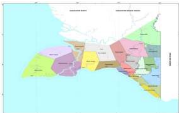
Figure 1. Administrative Map of Merauke Regency

Merauke Regency consists of 20 districts, 11 sub-districts, and 179 villages. Waan District is the largest district with an area of 5,416.84 km 2 or about 12 percent of the entire area of Merauke Regency. Meanwhile, Semangga District is the smallest district because it only has an area of 326.95 km 2 or less than 1 percent of the entire area of Merauke Regency.