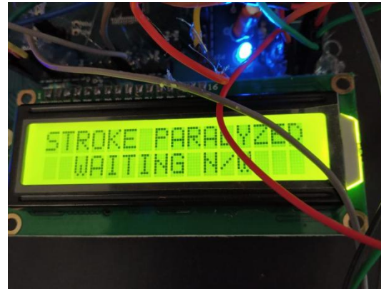
Figure 1.0: Initial display

Once the connection between the device and amazon cloud server is established the initial conditions of the various components are checked such as bed, light and mp3 speaker. Initially bed rotates up and down, light gets on and after some delay gets off and a welcome voice is heard from the speakers. Temperature sensor LM35 is used to record the temperature changes in one's body. LM35 is an integrated analog temperature sensor whose electrical output is proportional to Degree Centigrade. LM35 sensor does not require any external calibration or trimming to provide typical accuracies. The LM35 temperature sensor is used to detect precise centigrade temperature. The output of this sensor changes describes the linearity.