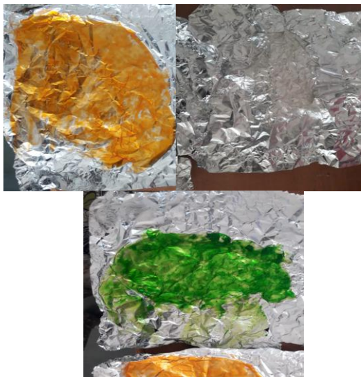
Figure 1: Bio-Plastic Film

will associate with 10-15 minutes. Irregularities may start to frame if blonde gets overheated. Include two drops of sustenance shading on the off chance that you might want to shading the plastic. Pour the blend onto foil. Spread the warmed blend into a bit of a foil or material paper to give it a chance to cool. On the off chance that you might want to form the plastic into a shape, it must be done when it is warm. Evacuate any air pockets that you see by jabbing them with toothpicks. Enable the plastic to dry for somewhere around three days. It requires investment for the plastic to dry and solidify. As it cools, it will start to dry out. Contingent upon thickness of the plastic, it can take more time for it to dry. In the event that you make a little thick piece it will require longer investment to dry than a more slender bigger piece. Leave the plastic in cool, dry spot for this procedure. Check the plastic following three days to check whether it has completely solidified.