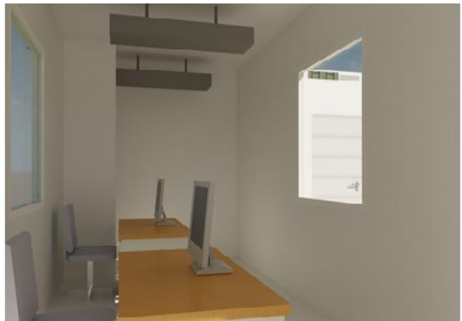
(b) Right Sight