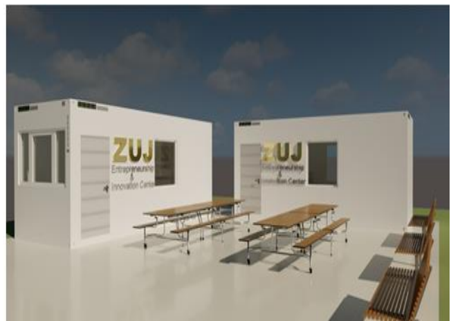
(b) East Façade