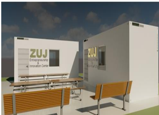
(a) North Façade