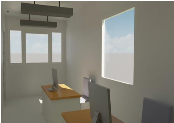
(a) Left Sight

Maya, AutoCAD, and 3D Max technology are used for the design. The basic idea of this project is to save time, effort, construction cost, and space, considering the place's aesthetics and the student's satisfaction. Images show the preliminary design and each of them is discussed. Figure 2 shows the preliminary interior design for the container.